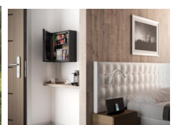
INDEL B - Flyingbar