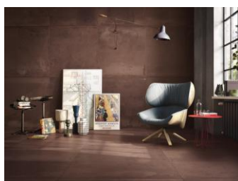
COOPERATIVA CERAMICA D'IMOLA – Tube