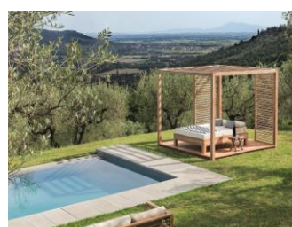
IL GIARDINO DI LEGNO – Saint Tropez Collection