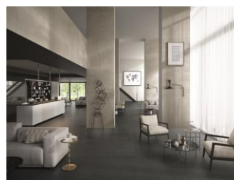
CAESAR CERAMICHE - Autore