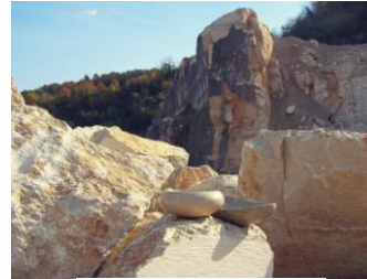
MARMI FAEDO – Grolla Marble