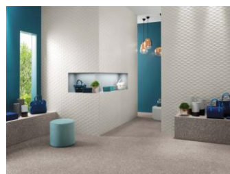
ATLAS CONCORDE – 3D Stars