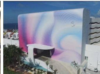
MOSAICO DIGITALE – Temptation Hotel by Karim Rashid