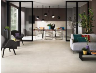
LEA NORTH AMERICA – Next One