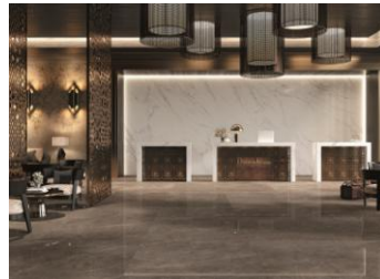
MIRAGE - Jewels